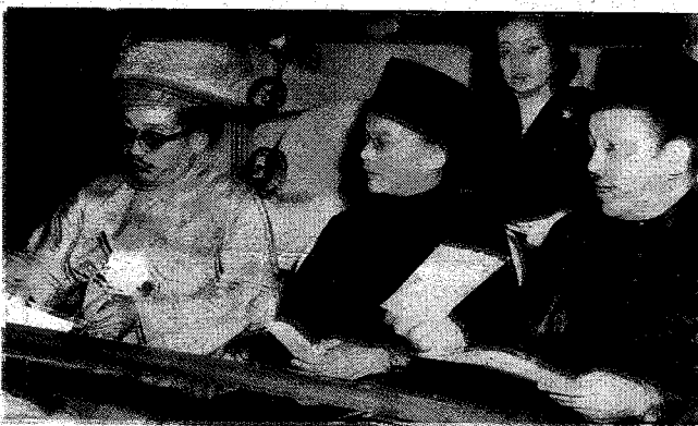
The Malayan delegation at the opening session of the 12th General Assembly in New York on Sept 17, 1957. Ismail is at left.

■ TOMORROW: The formation of Malaysia was followed by two major challenges — Confrontation with Indonesia and the separation of Singapore. Their toll on Dr Ismail's worsening health leads to his resignation from the Cabinet.