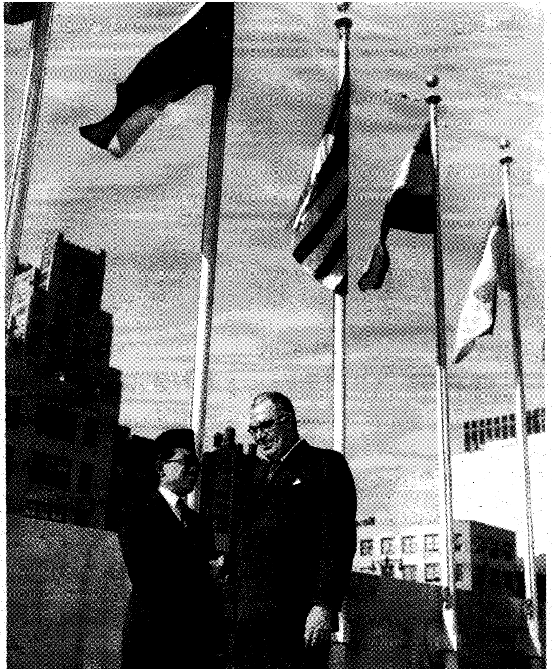
Sir Leslie Munroe of New Zealand (right), president of the United Nations General Assembly, congratulating Ismail after the flag of the newly independent Malayan Federation was raised in a ceremony at the UN headquarters in New York on Oct 15, 1957.

We look forward to a regional association embracing Thailand, Burma, Indonesia, Singapore, Malaysia, Philippines, Cambodia,