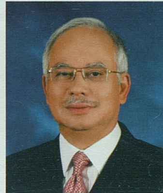
Prime Minister Malaysia