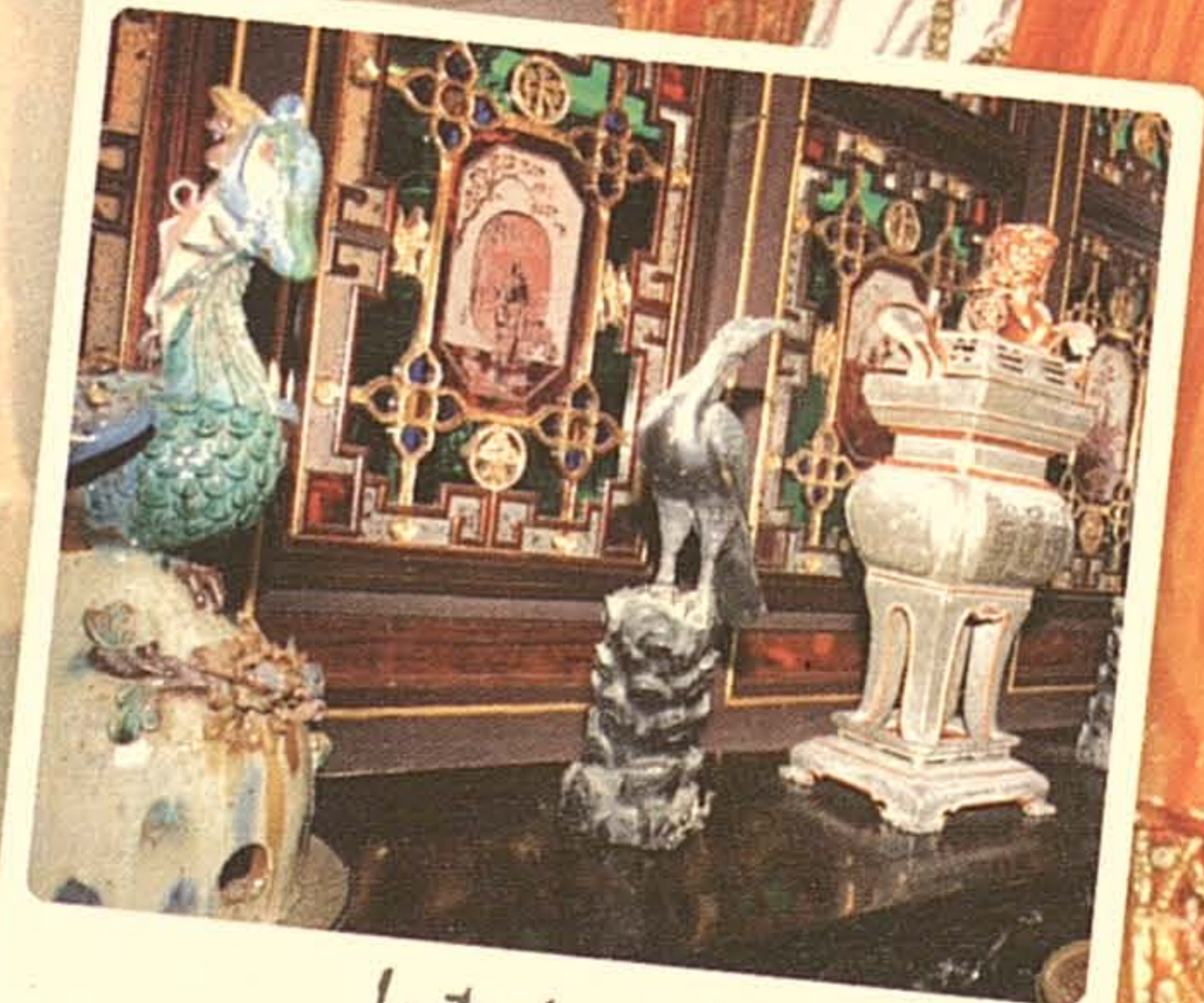
Interior of Penang Peranakan Mansion

During these occasions, Malaysians not only renew their friendship among friends of various races and religions but also enjoy mouth-watering delicacies. The Open House concept of celebration is a unique feature that exists in Malaysia and attracts tourists from all over the world.