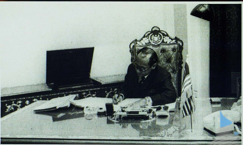
Picture... Personal collection of Tuanku Abdul Halim. Gambar... Koleksi peribadi Tuanku Abdul Halim.

(gambar kecil). Tuanku Abdul Halim sebagai Yang di-Pertuan Agong kelima pada tahun 1970.