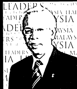
YB. Dato' Shahrir bin Abdul Samad Minister of Domestic Trade and Consumer Affairs