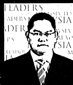
YB. Dato' Haji Noh bin Omar Minister of Entrepreneurial and Cooperative Development