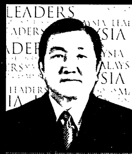
YB. Dato' Seri Ong Ka Chuan Minister of Housing and Local Government