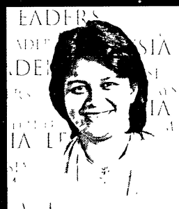
YB. Datuk Seri Azalina binti Othman Said Minister of Tourism