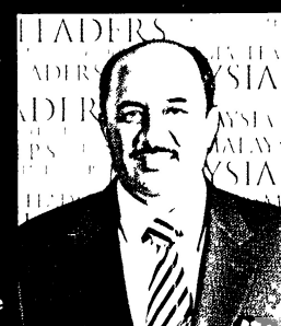
YB. Dato' Sri Haji Zulhasnan bin Rafique Minister of Federal Territories