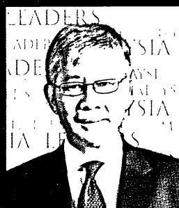
YB. Senator Tan Sri Datuk Amirsham bin Abdul Aziz Minister in Prime Minister Department (Economic Planning Unit)