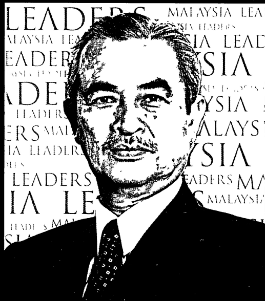
YAB. Dato' Seri Abdullah bin Haji Ahmad Badawi Prime Minister of Malaysia Minister of Defence