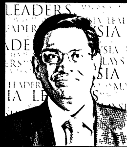
B. Datuk Dr. S Subramaniam A/L K.V. Sathasivam Minister of Human Resources