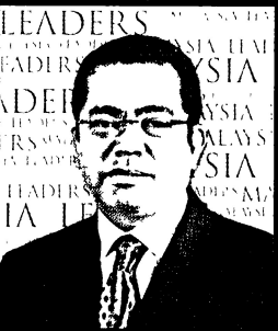
YB. Dato' Seri Mohamed Khaled bin Nordin Minister of Higher Education