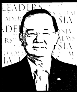
YB. Datuk Peter Chin Fah Kui Minister of Plantation Industries & Commodities