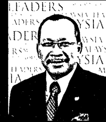
YB. Dato' Razali bin Ismail Deputy Minister of Education II