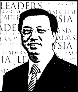
YB. Dato' Liow Tiong Lai