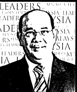
YB. Dato' Seri Syed Hamid bin Syed Jaafar Albar Minister of Home Affairs