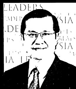
YB. Dato' Sri Ong Tee Keat Minister of Transport