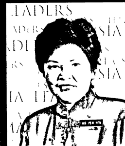
YB. Dato' Sri Dr Ng Yen Yen Minister of Women, Family and Community Development