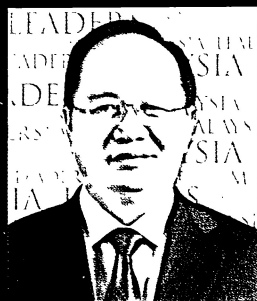
YB. Tan Sri Datuk Seri Panglima Bernard Giluk Dompok Minister in Prime Minister Department