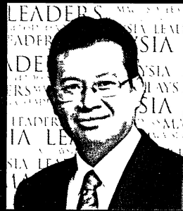
YYB. Dato' Ahmad Shabery Cheek Minister of Information