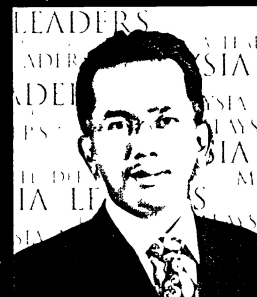
YB. Dato' Shaziman bin Abu Mansor Minister of Energy, Water and Communications