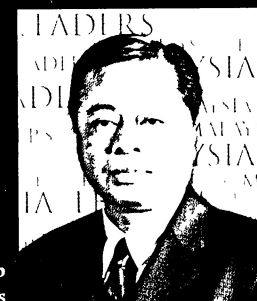
YB. Datuk Ismail Sabri bin Yaakob Minister of Youth and Sports