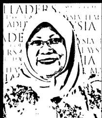
YB. Datin Paduka Rohani binti Haji Abdul Karim Deputy Minister of Agriculture & Agro-based Industry