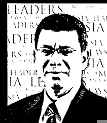
YB. Dato' Saiffuddin bin Abdullah Deputy Minister of Entrepreneurial and Cooperative Development