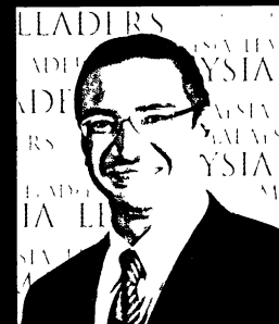
YB. Dato' Seri Hishammuddin bin Tun Hussein Minister of Education