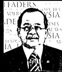
YB. Jelaing Anak Mersat Deputy Minister of Domestic Trade and Consumer Affairs