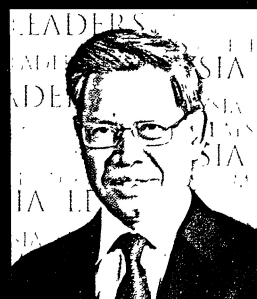
YB. Dato' Mustapa bin Mohamed Minister of Agriculture & Agro-Based Industry