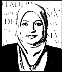
YB. Senator Dato' Dr Mashitah binti Haji Ibrahim Deputy Minister in Prime Minister Department