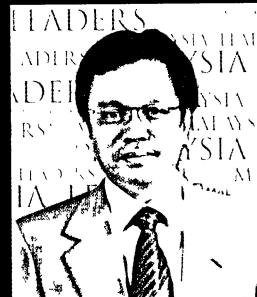
YB. Dato' Seri Haji Mohd Shafie bin Haji Apdal Minister of National Unity, Culture, Arts and Heritage