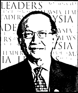
YB. Dato' Seri Utama Dr. Rais Yatim Minister of Foreign Affairs