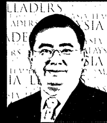
YB. Datuk Ir. Dr. Wee Ka Siong Deputy Minister of Education I