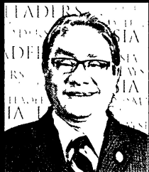
YB. Dato' Haji Hassan bin Malek Deputy Minister in Prime Minister Department