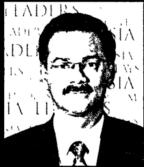
YB. Tuan Devamany a/I S. Krishnasamy Deputy Minister in Prime Minister Department