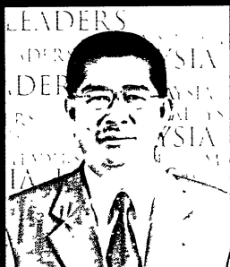
YB. Datuk Dr Maximus Johnity Ongkili Minister of Science, Technology and Innovation