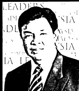
YB. Dato' Seri Dr. Ahmad Zahid bin Hamidi Minister in Prime Minister Department