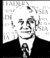
YB. Datuk Wira Abu Seman bin Haji Yusop Deputy Minister of Defence