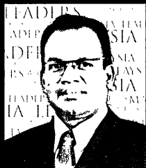
YB. Senator Tuan Murugiah a/I Thopasamy Deputy Minister in Prime Minister Department