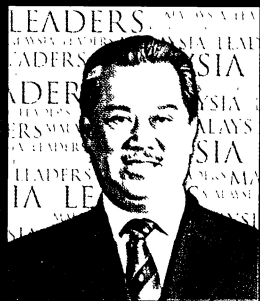
YB. Tan Sri Dato' Haji Muhyiddin bin Haji Mohd Yassin Minister of International Trade and Industry