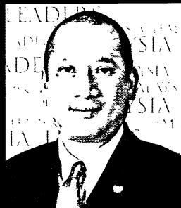
YB. Dato' Seri Mohamed Nazri bin Abdul Aziz Minister in Prime Minister Department