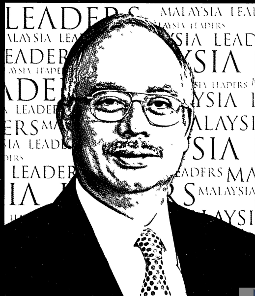
YAB. Dato' Sri Mohd. Najib bin Tun Haji Abdul Razak Deputy Prime Minister of Malaysia Minister of Finance