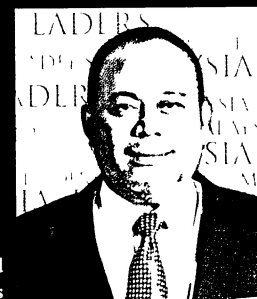
YB. Dato' Ir. Mohd. Zin bin Mohamed Minister of Works