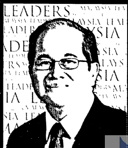
YB. Datuk Douglas Uggah Embas Minister of Natural Resources and Environment