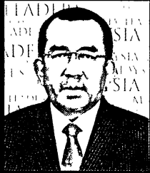
YB. Dato' Mohd Johari bin Baharum Deputy Minister in Prime Minister Department