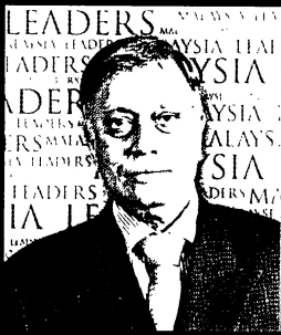
YB. Senator Tan Sri Nor Mohamed bin Yakcop Minister of Finance II