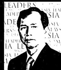
YB. Dato' Joseph Salang Anak Gandum Deputy Minister of Energy, Water and Communications