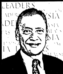
YB. Senator Tan Sri Dato' Seri Muhammad Muhammad Taib Minister of Rural & Regional Development