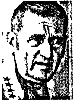
General Tommy Franks

US General Tommy Franks tours Central Asia in an attempt to build military aid relationships with nations there, but finds no takers. Russia's power in the region appears to be on the upswing instead. Russian Defense Minister Igor Sergeev writes, "The actions of Islamic extremists in Central Asia give Russia the chance to strengthen its position in the region." However, shortly after 9/11, Russia and China agree to allow the US to establish temporary US military bases in Central Asia to prosecute the Afghanistan war. The bases become permanent, and the Guardian will write in early 2002, "Both countries increasingly have good reasons to regret their accommodating stand. Having pushed, cajoled, and bribed its way into their Central Asian backyard, the US clearly has no intention of leaving any time soon." [Guardian, 2/10/2002]