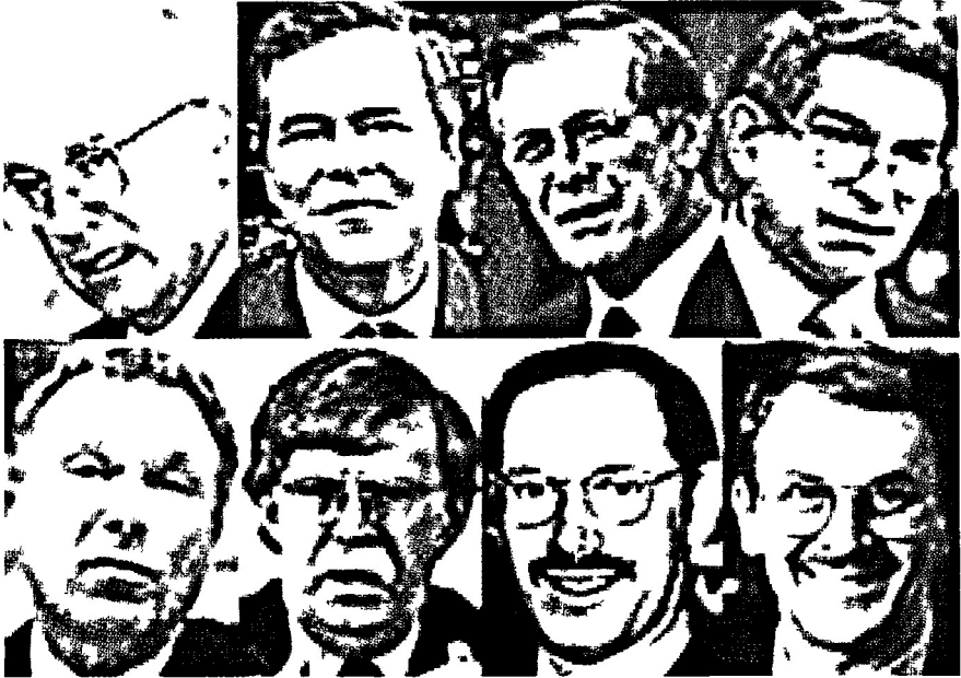
People involved in the 2000 PNAC report (from top left): Vice President Cheney, Florida Governor Jeb Bush, Defense Secretary Rumsfeld, Deputy Defense Secretary Paul Wolfowitz, Cheney Chief of Staff I. Lewis Libby, Undersecretary of State John Bolton, Undersecretary of Defense Dov Zakheim, and author Eliot Cohen.