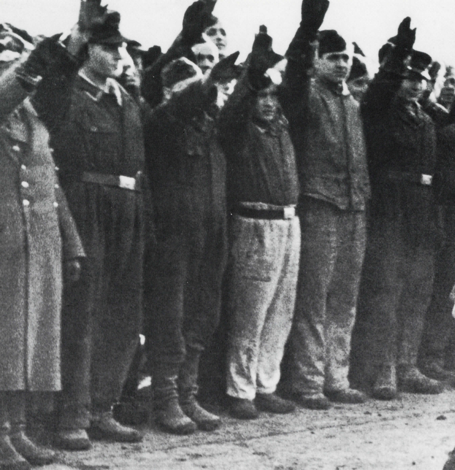
Luftwaffe ground personnel salute a careworn Adolf Hitler in the fall of 1944 during one of his last visits to a forward air base. Walking beside Hitler is his devoted pilot, Hans Baur, who began flying for the aspiring Führer in 1932 during the whirlwind election campaigns that brought Hitler and the Nazi party to national prominence.