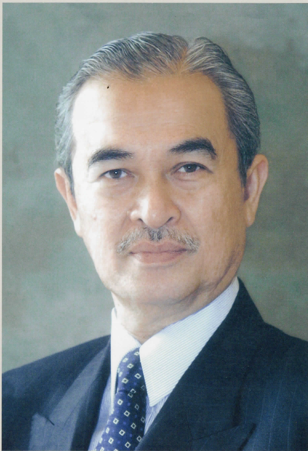
Rt. Hon. Dato' Seri Abdullah Ahmad Badawi Prime Minister of Malaysia