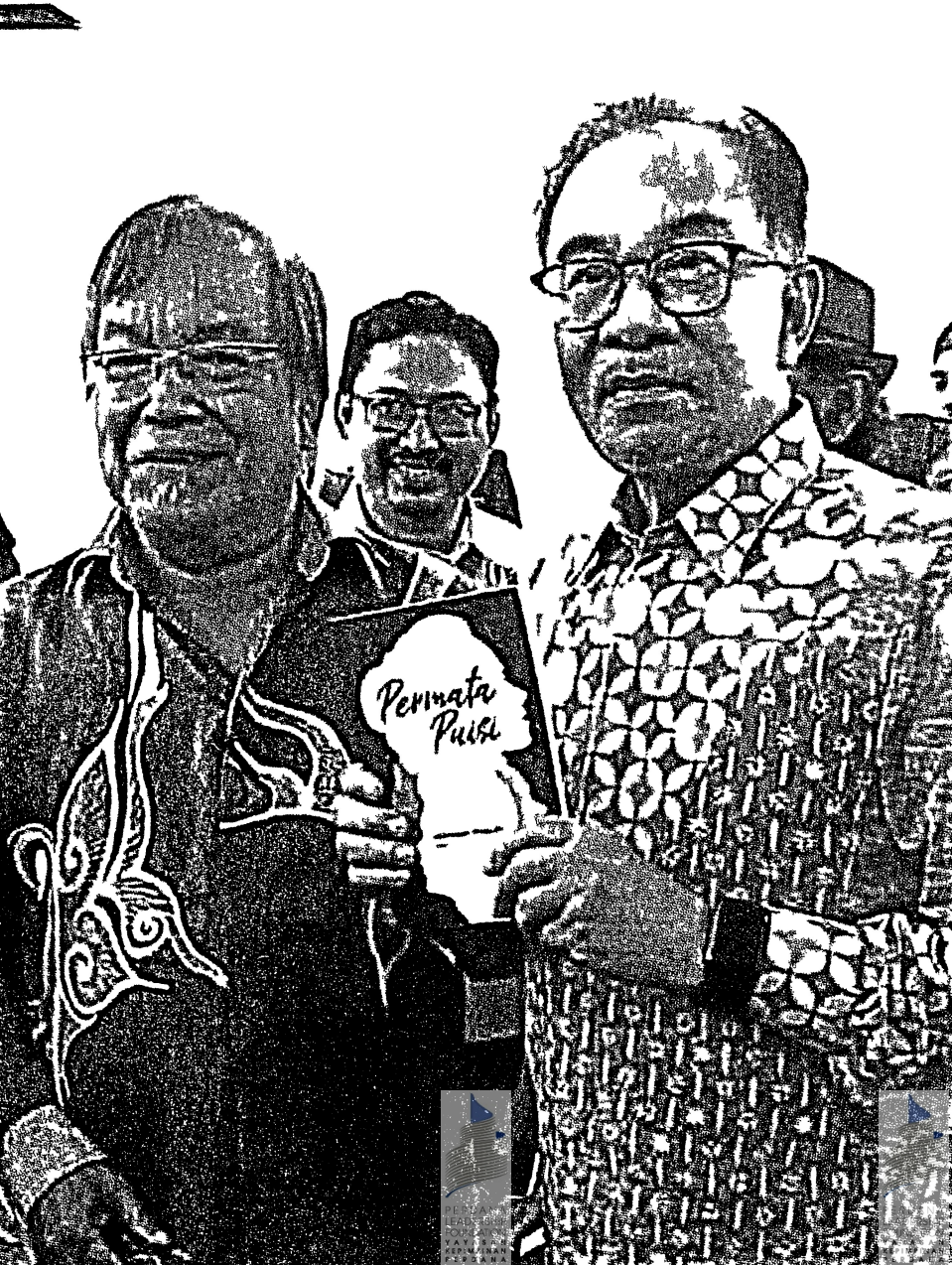
Dato' Rahman Shaari with the Prime Minister, Dato' Seri Anwar Ibrahim at the Kuala Lumpur International Book Fair, WTC, 2023.