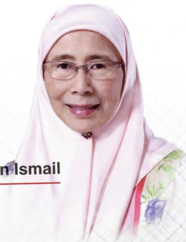
YAB Dato' Seri Dr. Wan Azizah Dr. Wan Ismail Deputy Prime Minister