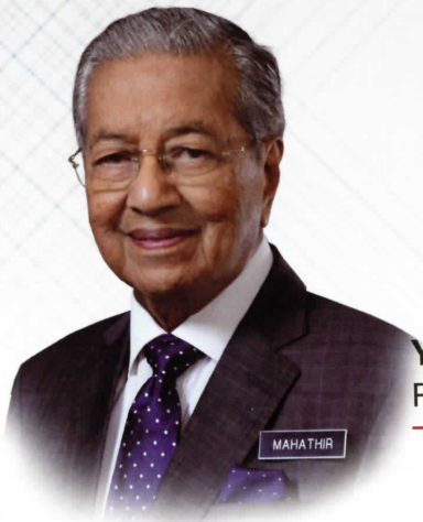
YAB Tun Dr. Mahathir bin Mohamad Prime Minister