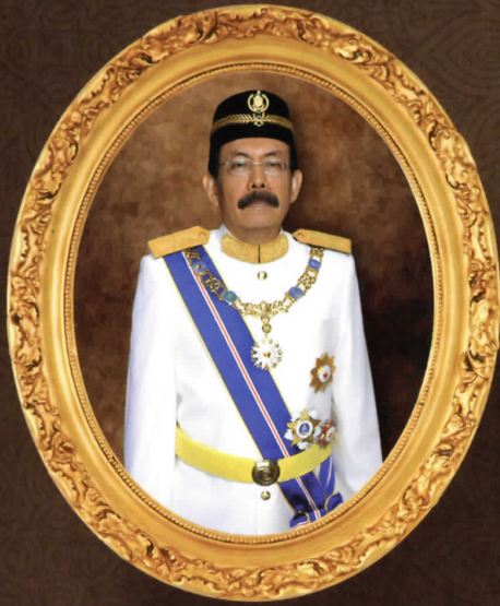
TUAN YANG TERUTAMA TUN DATUK SERI PANGLIMA (DR.) HAJI JUHAR BIN DATUK HAJI MAHIRUDDIN

S.M.N., S.P.D.K., P.G.D.K., P.J.N., A.S.D.K., J.P., Hon. Ph.D(UoW) UK