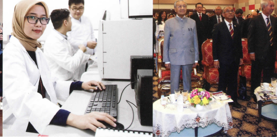
TABLE OF CONTENT • 目次