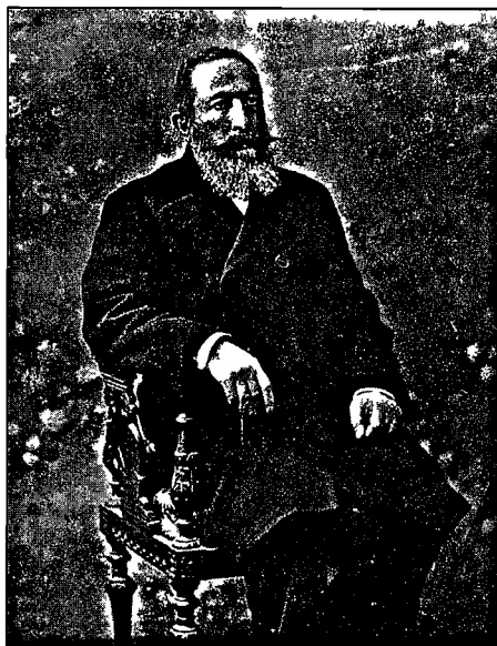
THE KHALIDI LIBRARY