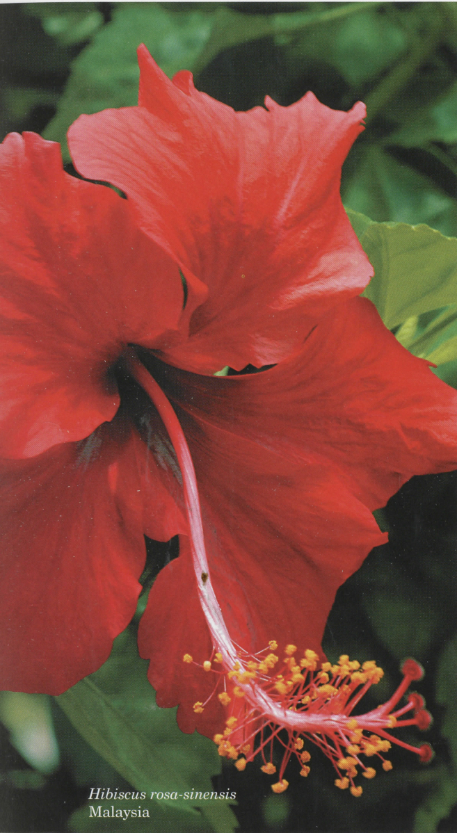
Hibiscus rosa-sinensis Malaysia

The single red form of the hibiscus Hibiscus rosa-sinensis , national flower of Malaysia, was first described in Chinese by Chi Han in his book Nan-Fang Ts'ao Mu Chuang (Plants of the Southern Region) in AD 304, over 1700 years ago. It was noted as a shrub growing to 2m tall, with flowers scarlet in colour, in parts of five, with a single stalk protruding beyond the petals and bearing golden freckles (anthers); on a single bush. Many flowers would bloom every day, opening in the morning and fading at nightfall.