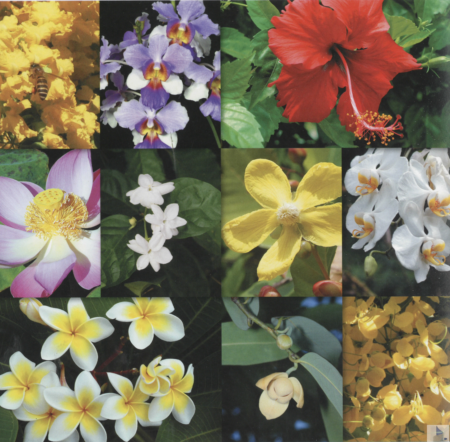
The national flowers of ASEAN