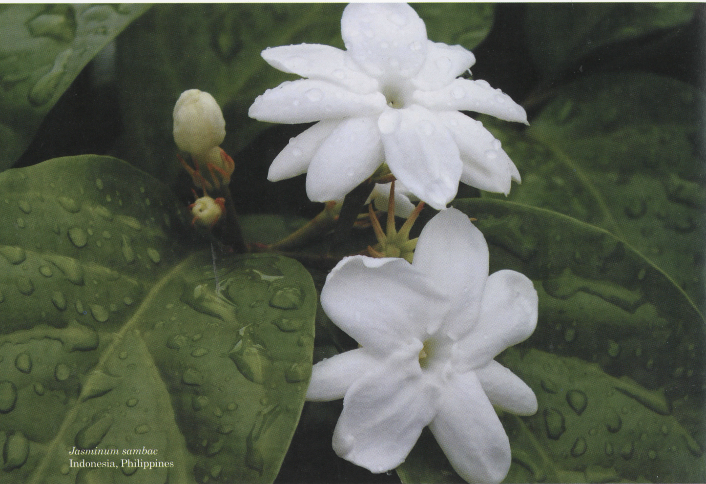
Jasminum sambac Indonesia, Philippines