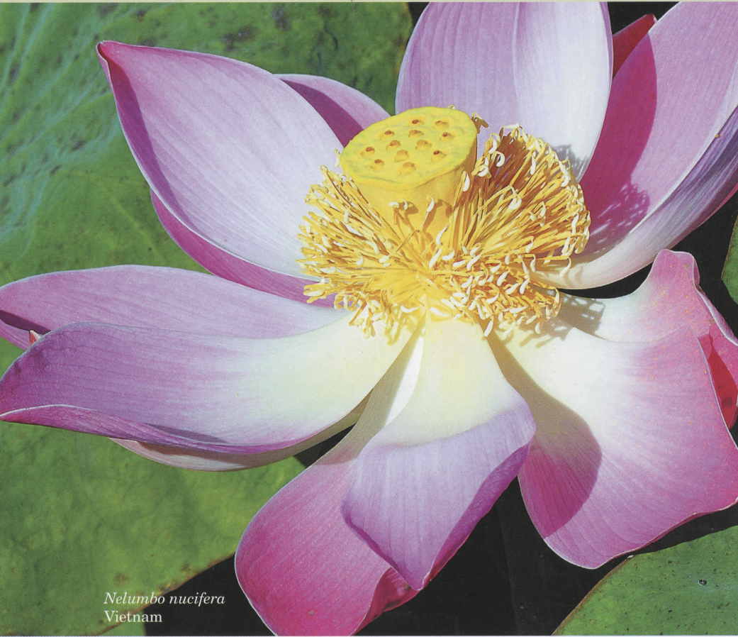
Nelumbo nucifera Vietnam

The 10 countries of ASEAN share a common 2500-year heritage in garden plants. The first written record of an ASEAN flower was of the lotus, Nelumbo nucifera , now the national flower of Vietnam. It was mentioned in the Sanskrit scriptures and revered for the purity of its flowers despite the muddy water in which it grows. The lotus holds the record for seed longevity. Seeds that got buried 1300 years ago, according to radiocarbon evidence, have been successfully revived and grown.