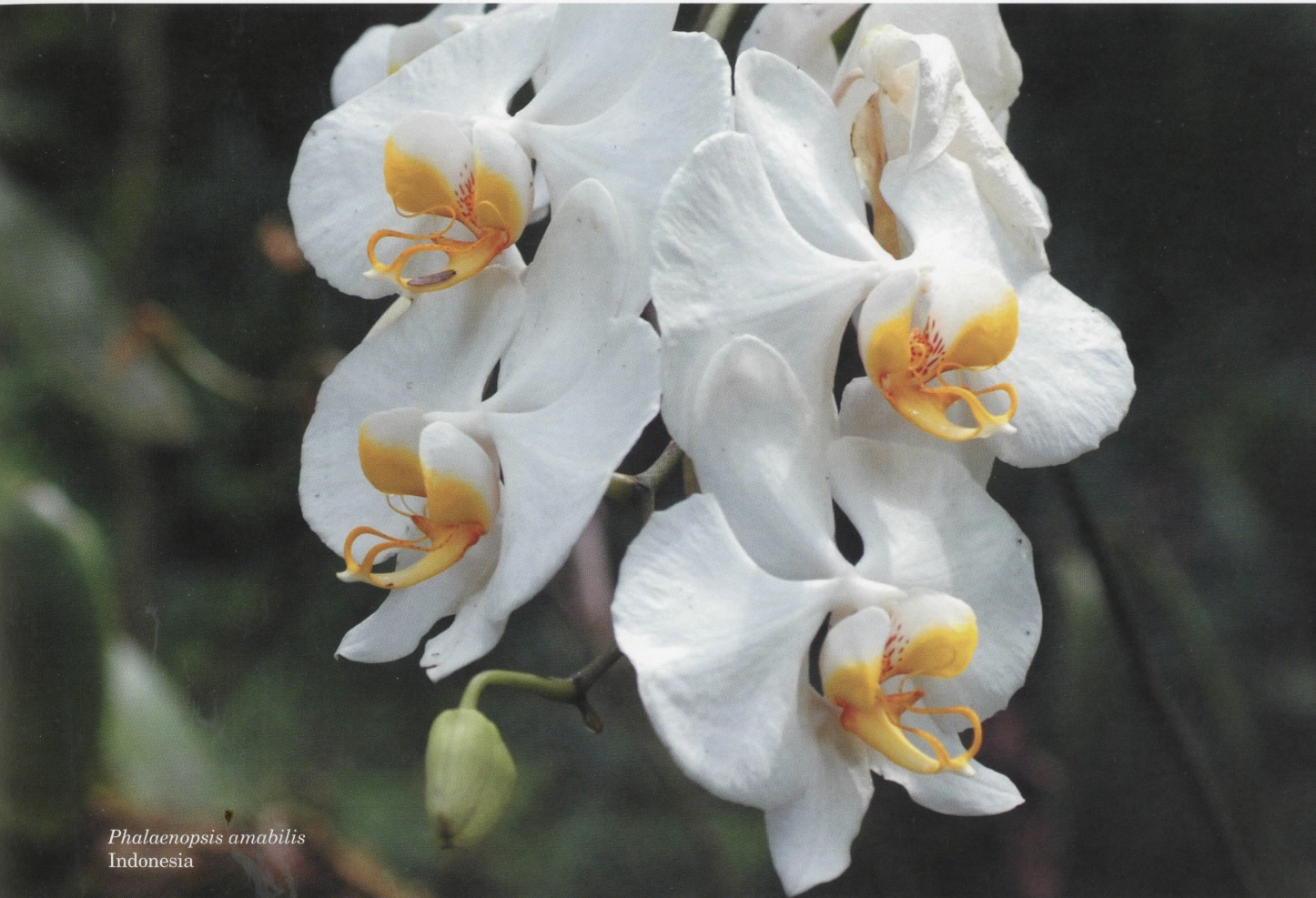
Phalaenopsis amabilis Indonesia

The other two national flowers of Indonesia are the rare Rafflesia arnoldii which holds the record as the largest flower (by diameter) in the world, named after Stamford Raffles who was from 1811-1816 the British Governor of Java; and the orchid anggrek bulan , Phalaenopsis amabilis (pictured here) first discovered by Rumphius in 1653 in an island near New Guinea, now known to occur naturally over a wide area including Borneo, Sumatra and Java.