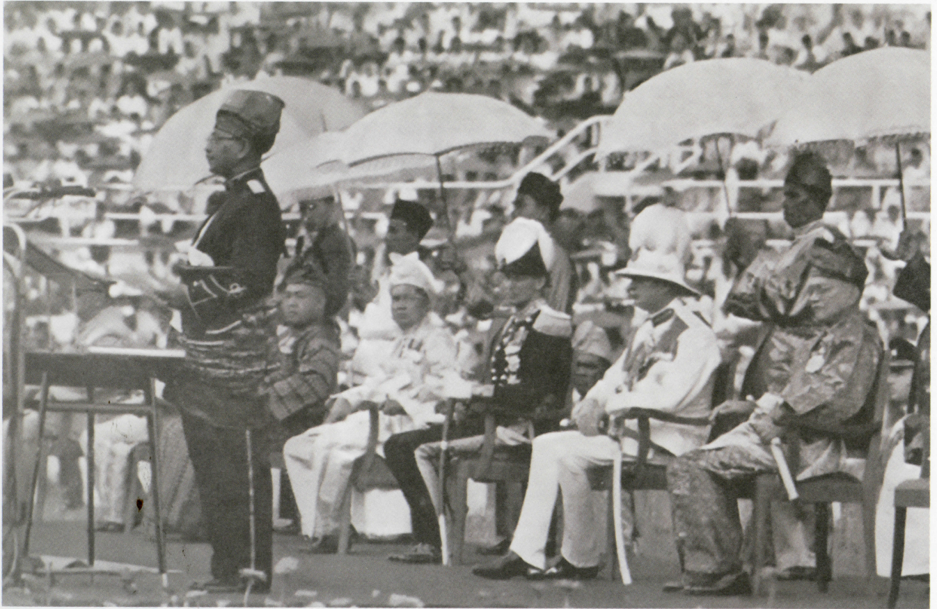
Photo of Sultan Hisamuddin 'Alam Shah witnessing the Declaration of Independence of the Federation of Malaya by Y.T.M Tunku 'Abdul Rahman Putra ibni al-Marhum Sultan 'Abdul Hamid Halim Shah (Y.T.M Tunku Sri Indra Putra of Kedah), the Prime Minister of the Federation of Malaya.

From left to right: Raja of Perlis, Tuanku Syed Harun Putra ibni al-Marhum Syed Hasan Jamalullayl; Sultan of Selangor, Sultan Hisamuddin 'Alam Shah, Hon., British High Commissioner to Malaya, Sir Donald Charles MacGillivray (1954 to 1957); H.R.H Duke of Gloucester, Prince Henry; and D.Y.M.M Seri Paduka Baginda Yang di-Pertuan Agong of the Federation of Malaya, Tuanku 'Abdul Rahman ibni al-Marhum Tuanku Muhammad.