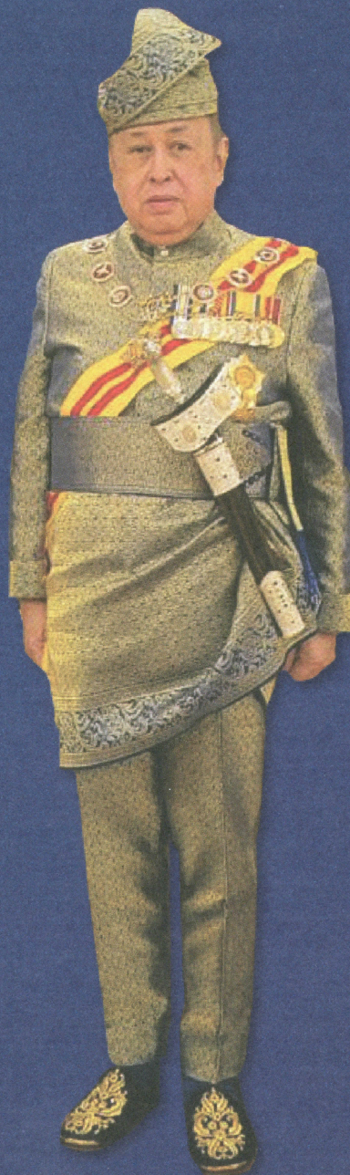
His Highness Tengku Sulaiman Shah Al-Haj ibni Almarhum Sultan Salahuddin Abdul Aziz Shah Al-Haj, D.K. (Johor), D.K.II (Selangor), S.P.M.J (Johor), S.P.M.S (Selangor), S.J.M.K (Kelantan), P.I.S (Johor)

His Highness Tengku Laksamana of Selangor