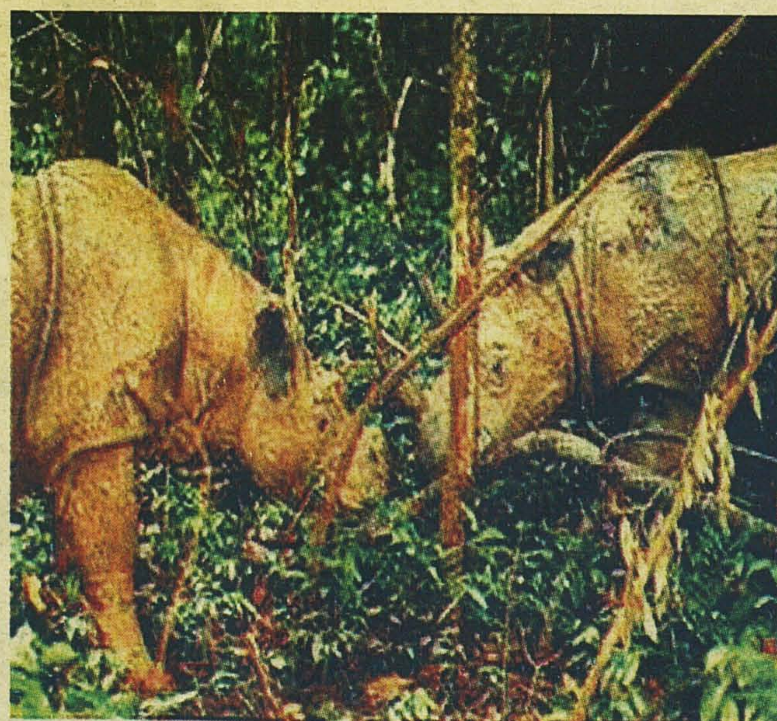
The critically endangered Sumatran rhinoceros may soon lose what's left of its habitat in Terengganu's forests.

"Increased siltation from logging could reduce the dam lifetime in the long run even if logging was only carried out during the construction stage