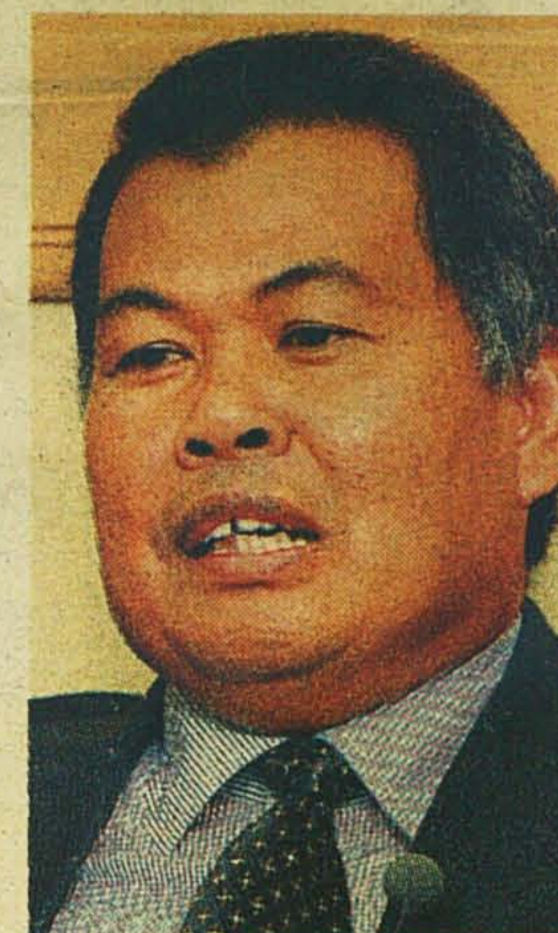
Datuk Ahmad Said Terengganu Menteri Besar

the party. These are traitors, not only to the party but also to the people.