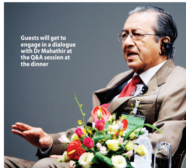
Guests will get to engage in a dialogue with Dr Mahathir at the Q&A session at the dinner