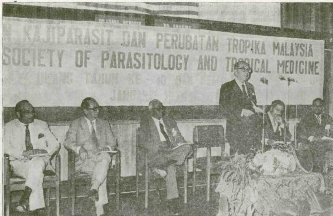
Tun Abdul Razak bin Datuk Hussein sedang berucap merasmikan pembukaan Perayaan Ulangtahun Ke 10 dan Seminar Persatuan Kajiparasit dan Perubatan Tropika Malaysia di Oditorium Jururawat, Hospital Besar, Kuala Lumpur pada 11hb Januari, 1974.