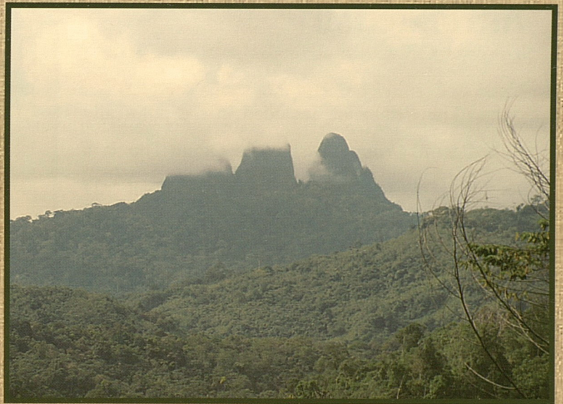
Three-peaked Batu Siman (above) Uket and Beran heading home after setting up the trap.