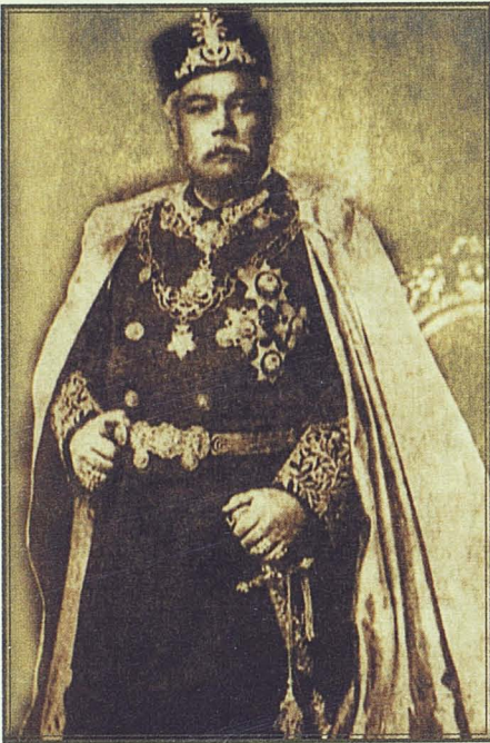
Sultan Abu Bakar (1833-1895)