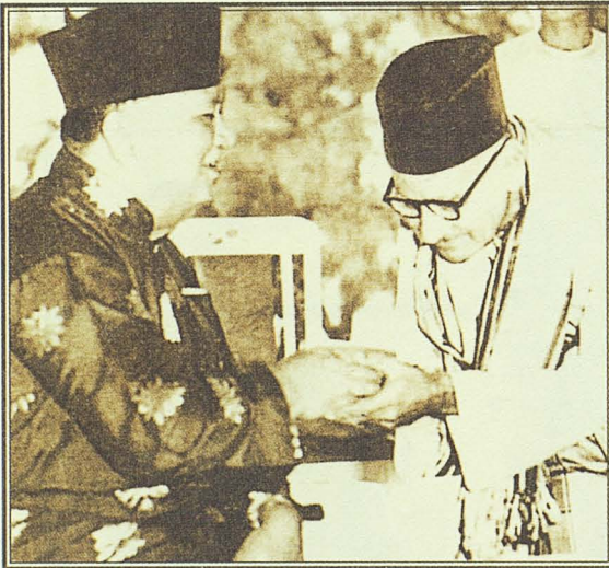
Dato' Onn bowed to Sultan Ismail as a sign of respect during the Sultan's birthday celebration