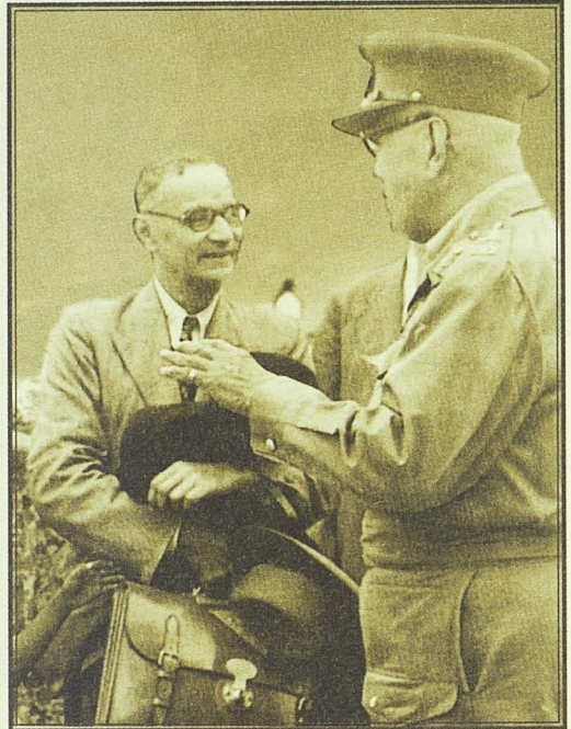
Sultan Ibrahim and Dato' Onn