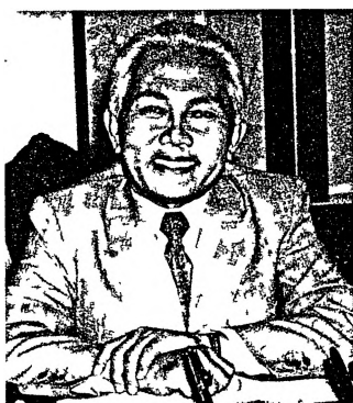
The Right Honourable the Chief Minister of Sarawak Pehin Sri Dr. Haji Abdul Taib Mahmud S.B.S., D.P., P.S.M., S.P.M.J., S.S.D.K., D.G.S.M., S.S.A.P., S.S.S.A., S.P.M.T., S.P.D.K., P.D.K., KT. W.E. (THAILAND), KEPN (INDONESIA), S.P.M.B. (BRUNEI), K.O.U. (KOREA), AO (AUSTRALIA), P.C.D.

Since the early days Sarawak has never fully exploited its potential even though the country had the richest resources. The white Rajahs were happy to keep the State and its natives under wraps and unexposed. It was felt that if the natives in the interior were introduced to modernisation, they would eventually lose their cultural identity.