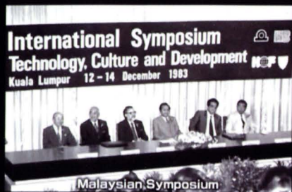
During this period, an international symposium focused on technology, culture, and development was held in Malaysia in 1983.