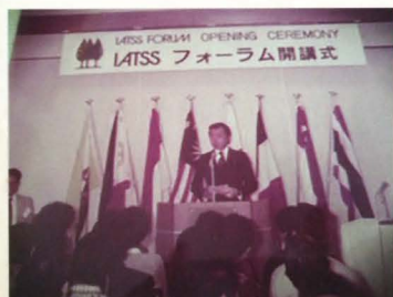
*The First Batch of participants, all Malaysians attended the first IATSS Forum in 1985. The Opening Ceremony was graced by "Their Imperial Highnesses Prince and Princess Tomohito of Mikasa".