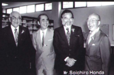
Mr. Soichiro Honda