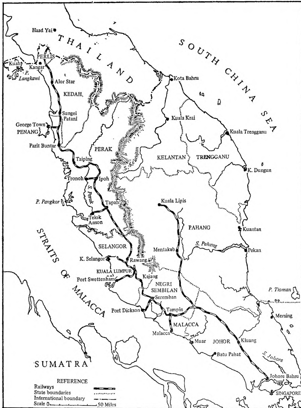
Map of Malaya circa 1922