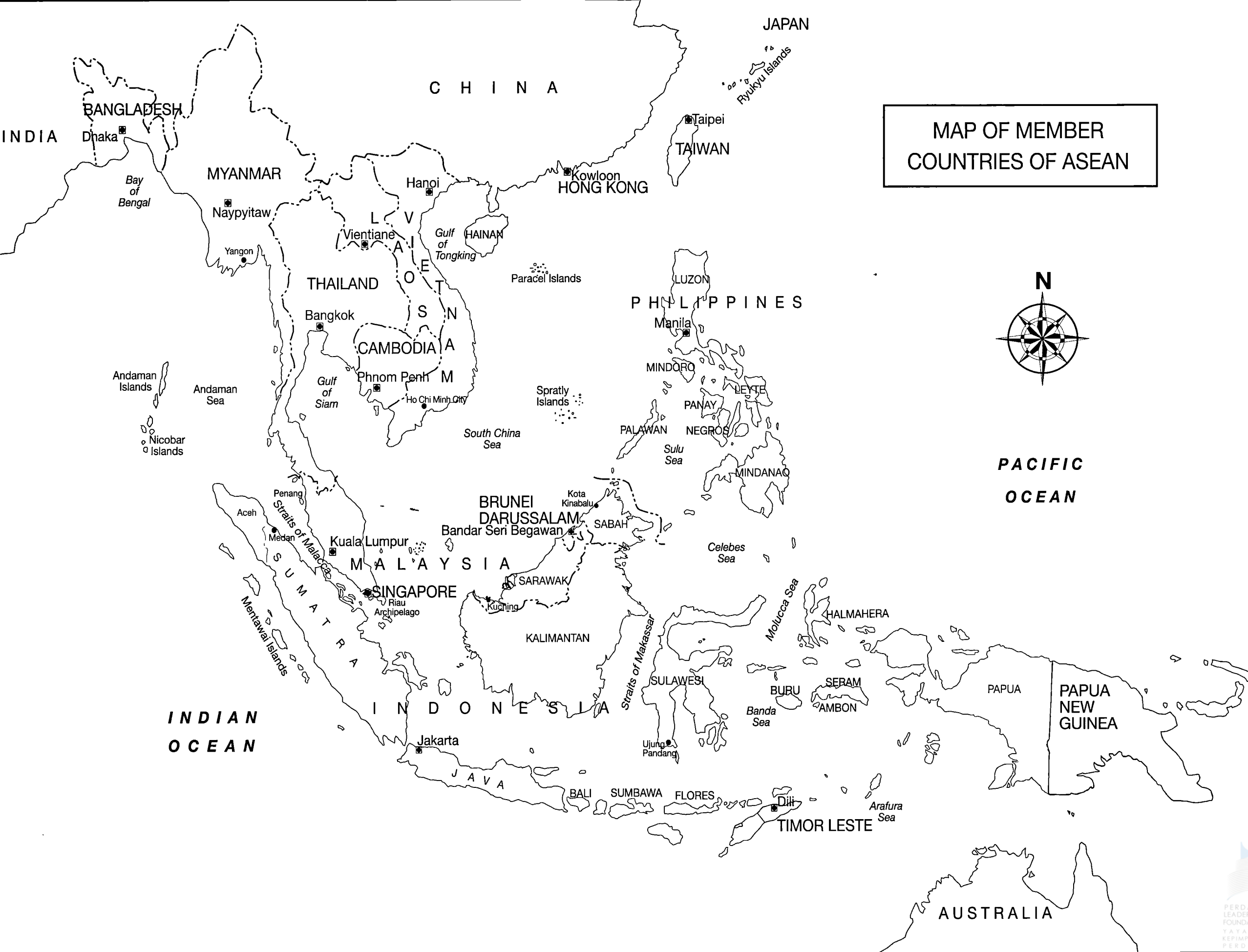
MAP OF MEMBER COUNTRIES OF ASEAN