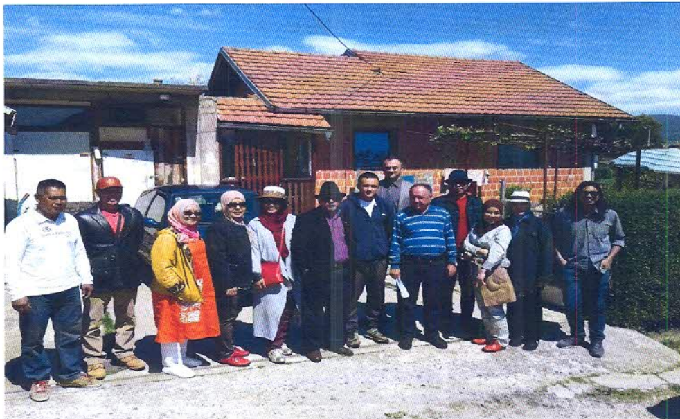
Group photo of Embassy officials and other Malaysians in Prijedor