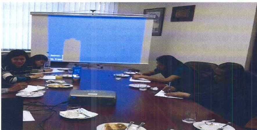
Briefing on TN 50 at the Embassy of Malaysia

TN50 will be the roadmap, after Vision 2020 that will transform the country's economy, citizen well-being, environment, technology, social interaction, governance and public administration.