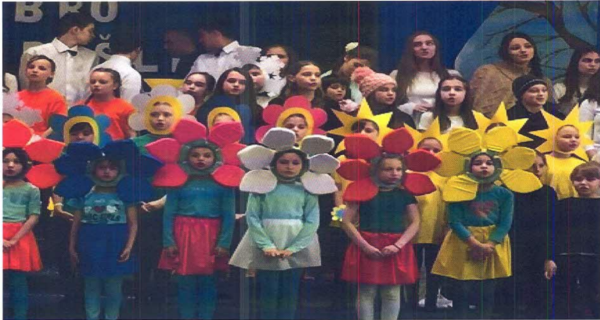
Bosnian students with Spring costumes