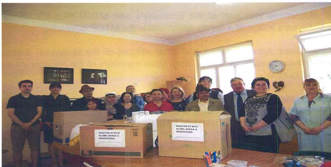
Group photo of Embassy officials, Members of MTCP Alumni Association, BiH and officials of the Institute of Protection for Female Children and Youth in Visegrad